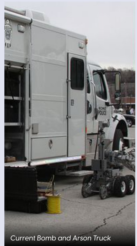
Current Bomb and Arson Truck

In 2023, through your generosity, we raised an astounding $750,000 specifically dedicated to providing the Kansas City Missouri Police Department (KCPD) with a state-of-the-art bomb and arson truck. We're thrilled to announce that the truck has been purchased and is currently in the process of being built. We anticipate its completion and delivery to the KCPD in 2024, a crucial addition to their resources in ensuring the safety of our community at many high-profile events to come, putting us on the international stage.