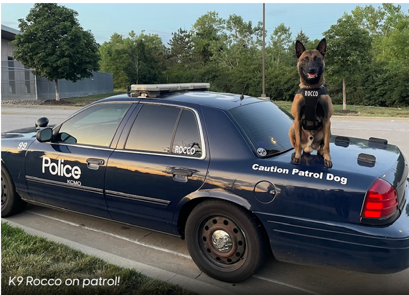
K9 Rocco on patrol!