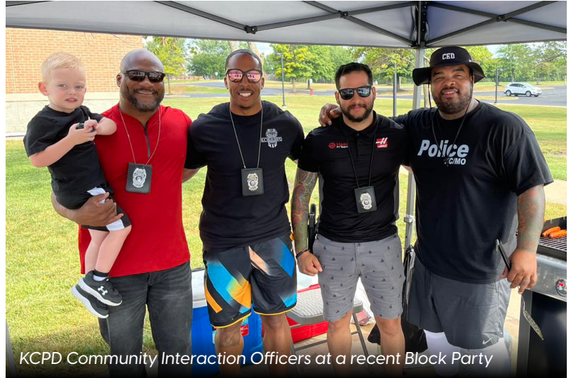
KCPD Community Interaction Officers at a recent Block Party