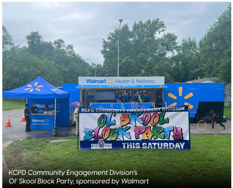
KCPD Community Engagement Division's Ol' Skool Block Party, sponsored by Walmart