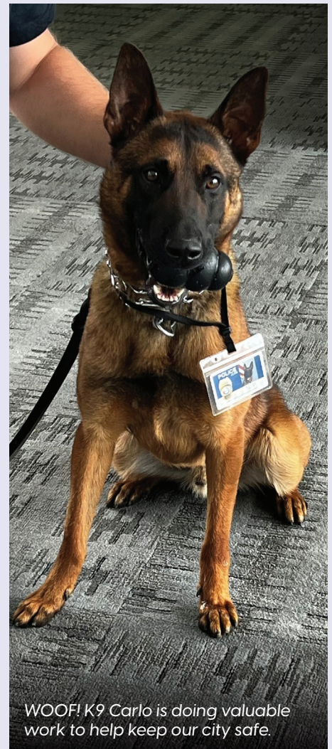
WOOF! K9 Carlo is doing valuable work to help keep our city safe.

We're thrilled to announce the newest member of the KCPD team – K9 Carlo! Thanks to the generosity of a funding partner, the Police Foundation of Kansas City was able to acquire Carlo, who officially joined the force in April. K9 Carlo is a valuable asset and partner to the KCPD, bringing his furry expertise to keep our community safe.