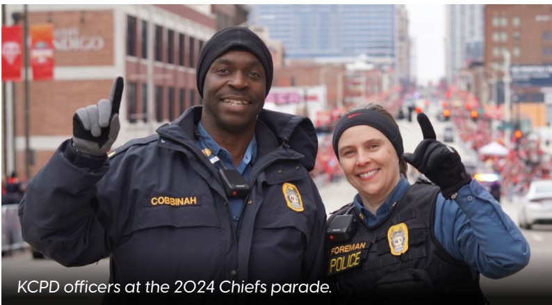
KCPD officers at the 2024 Chiefs parade.

Safety is a commitment woven into the fabric of Kansas City, and the KCPD tirelessly works to ensure the safety of all residents and visitors. The PFKC plays a crucial role in supporting these efforts through donor contributions that fund essential projects beyond the department's public budget. From providing protective gear and body cameras to funding mental health initiatives and social services, your support of the PFKC enhances the KCPD's capabilities. Your donations also foster a culture of trust and collaboration within the community, helping to make everyone in our community feel safe. Learn more about how your support makes a difference by visiting our website .