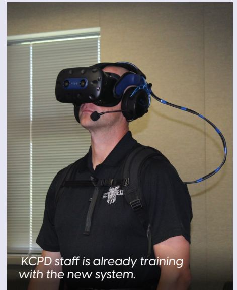
KCPD staff is already training with the new system.

The KCPD's new APEX Simulation VR system, funded by the Foundation in February and praised for its groundbreaking capabilities, is now operational, with installation completed and initial training courses beginning on June 18. Scheduled for integration into recruit training immediately, APEX immerses officers and recruits in realistic scenarios within a safe, controlled environment. Each simulation is followed by a critical debriefing session, fostering collaborative learning and rapid refinement of decision-making and deconfliction skills among participants. As noted by KCPD, APEX will be integral to enhancing de-escalation training, ensuring seamless integration of immersive scenarios that directly translate into real-world effectiveness. Your support of this transformational training system is deeply appreciated.