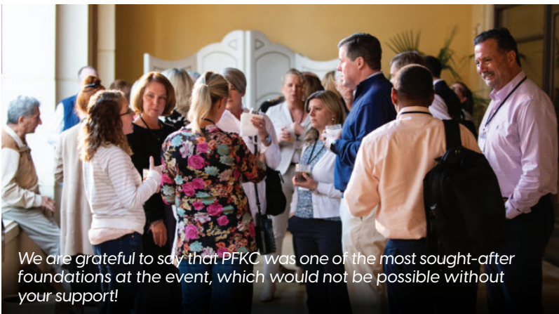
We are grateful to say that PFKC was one of the most sought-after foundations at the event, which would not be possible without your support!