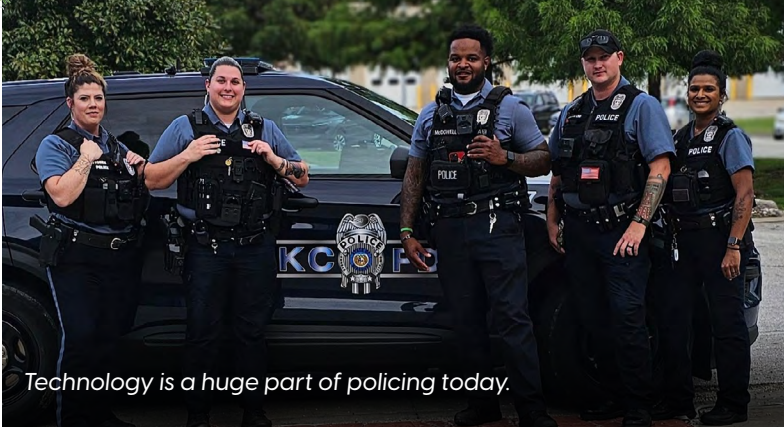
Technology is a huge part of policing today.