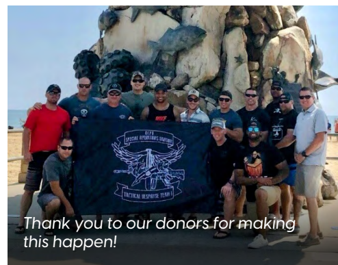
Thank you to our donors for making this happen!