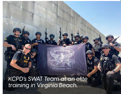
KCPD's SWAT Team at an elite training in Virginia Beach.

Special Weapons and Tactics (SWAT) teams are a critical component of modern law enforcement, originally developed to provide advanced training and specialized tools for handling complex and high-risk situations. These elite units are designed to give law enforcement agencies more options when responding to challenging scenarios that require exceptional skills and preparation. The Police Foundation is proud to have recently funded training expenses for the team to accept an invitation for specialized training in Virginia Beach, Virginia. The advanced training focused on developing sophisticated tactical approaches that minimize risk and maximize safety for everyone to include citizens, officers, and subjects/suspects during critical incidents. According to department leadership, these specialized skills have significantly improved the team's ability to respond effectively and safely in extraordinary circumstances, demonstrating the commitment to safety for everyone.