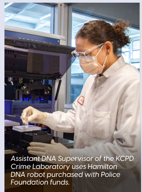
Assistant DNA Supervisor of the KCPD Crime Laboratory uses Hamilton DNA robot purchased with Police Foundation funds.

When you donate to PFKC, your dollars directly fund impactful safety initiatives that reduce crime and keep Kansas City safe. With your support, we can continue to invest in cutting-edge technology, equipment and programs that make a real difference. Join us in creating a safer future for Kansas City— donate today .