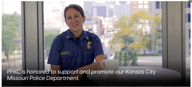
PFKC is honored to support and promote our Kansas City Missouri Police Department.