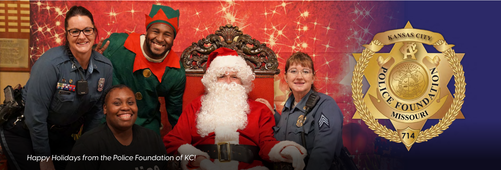
Happy Holidays from the Police Foundation of KC!

Q4 REVIEW WITH THE POLICE FOUNDATION OF KANSAS CITY