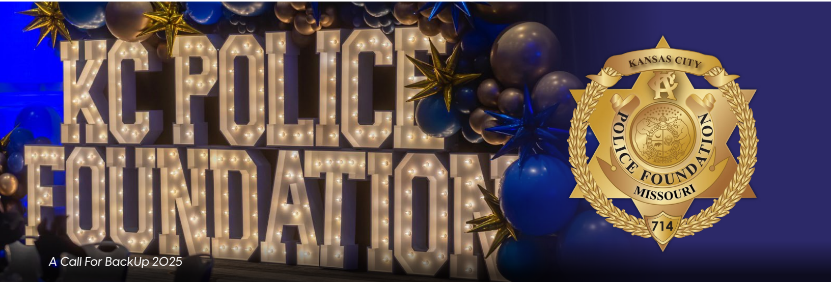
A Call For BackUp 2025

Q1 REVIEW WITH THE POLICE FOUNDATION OF KANSAS CITY