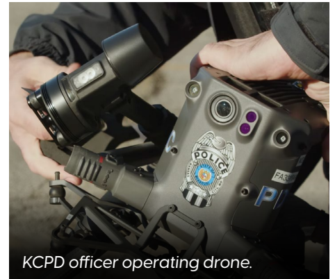
KCPD officer operating drone.

Every day, the brave women and men of the Kansas City Missouri Police Department put their lives on the line to ensure the safety of our community. But, as crime evolves, the tools and technologies that our police officers use must as well. KCPD has identified two crucial instruments: Drones as First Responders and Peregrine, to enhance safety and efficiency on a multitude of levels.