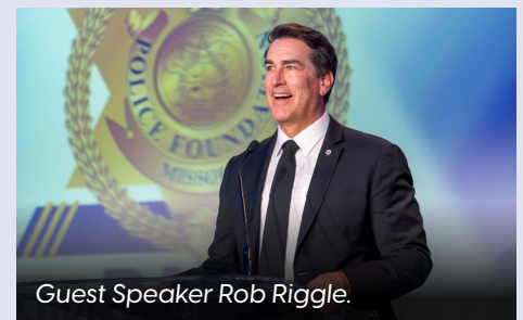
Guest Speaker Rob Riggle.