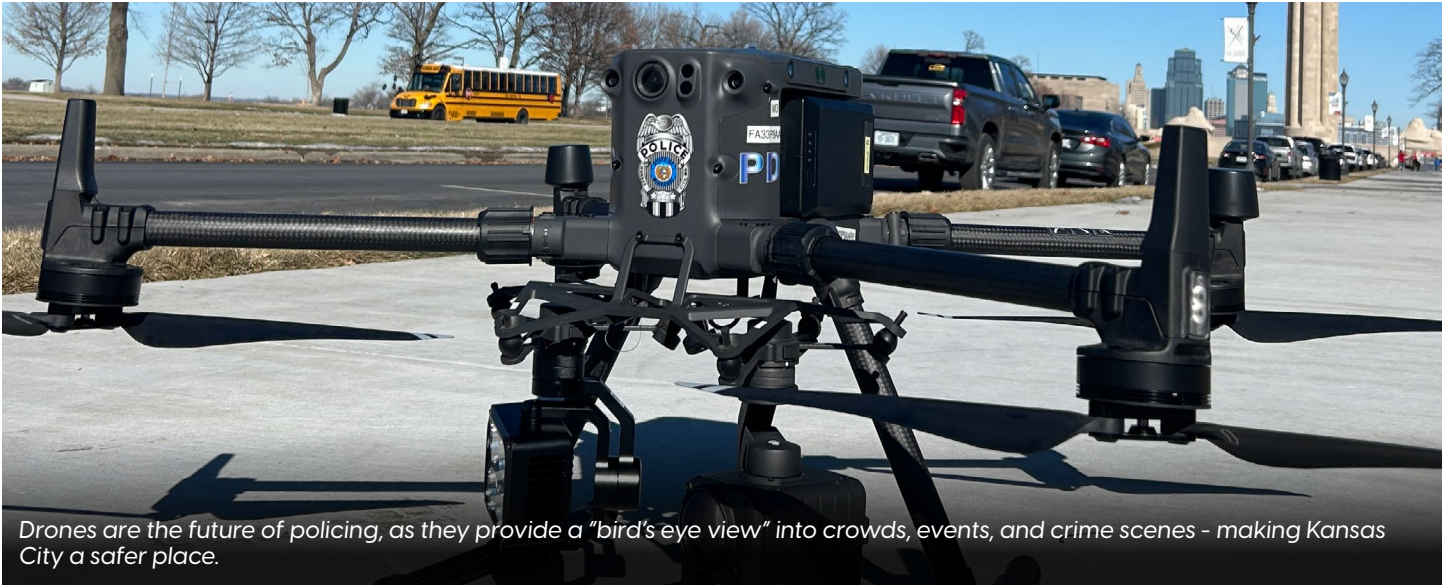
Drones are the future of policing, as they provide a "bird's eye view" into crowds, events, and crime scenes - making Kansas City a safer place.